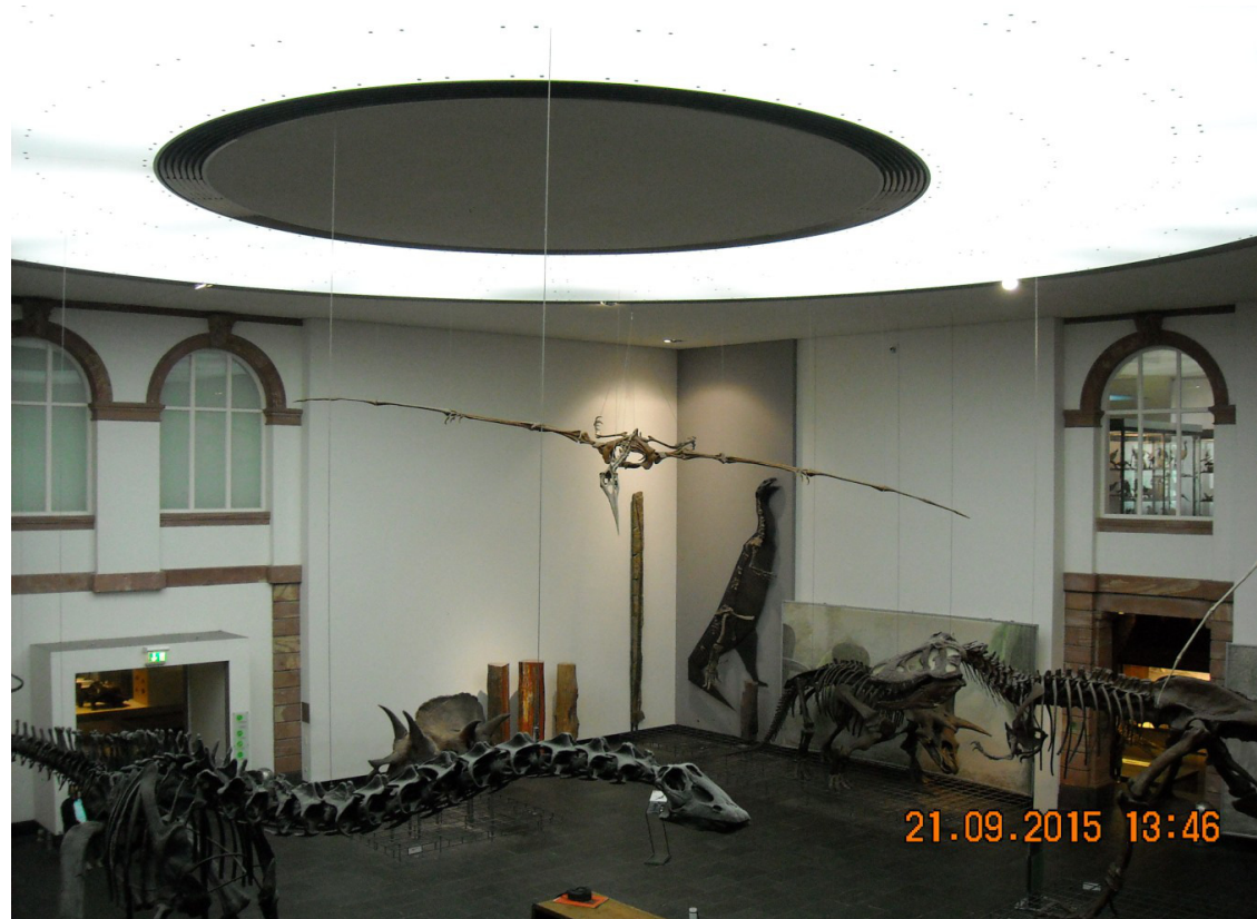
Figure 3.1: Flying Saurian with about 10 m Span

In Senckenberg museum in Frankfurt at Main, flying saurians are exhibited with about 10 m span, which could fly.